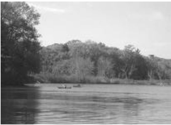
Kayaks on Wares Cove

The 1813 construction of the Moody St. mill dam in Waltham created the Lakes District of the Charles River, but this was not as we know it today. A branch of the Charles connected Flowed Meadow with Crams Cove in Waltham, leaving part of Waltham and a bit of Newton as islands. Beginning in the 1920's dumping, dams and bridges transformed much of the region into a polluted and unsightly area.