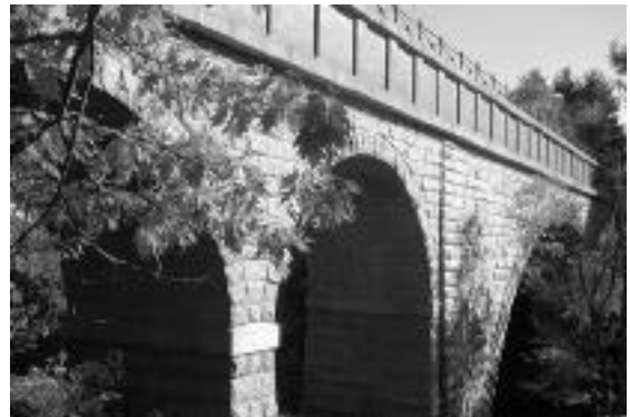
Sudbury Aqueduct: Echo Bridge

The MWRA's new water supply tunnel, the Metrowest Water Supply Tunnel (MWWST), will provide redundancy to the Hultman Aqueduct and will terminate in Weston. At the completion of this project in 2004, the Weston Aqueduct and reservoir will only be used for emergencies. Use of the Sudbury Aqueduct, which traverses Newton, also diminishes. The MWRA has agreed to review and analyze the feasibility of increasing public access to the Weston and Sudbury aqueduct rights-of-way. However, because these aqueducts are constructed of brick, the MWRA prefers low impact uses, such as bicycle and pedestrian.