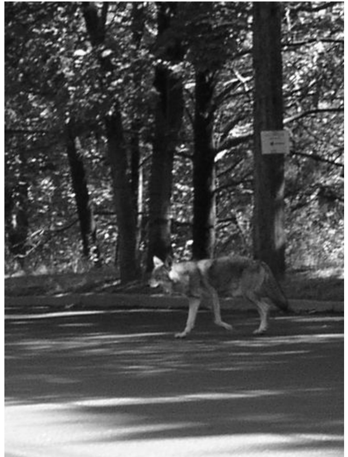
Coyote crossing Winchester Street near Nahanton Park