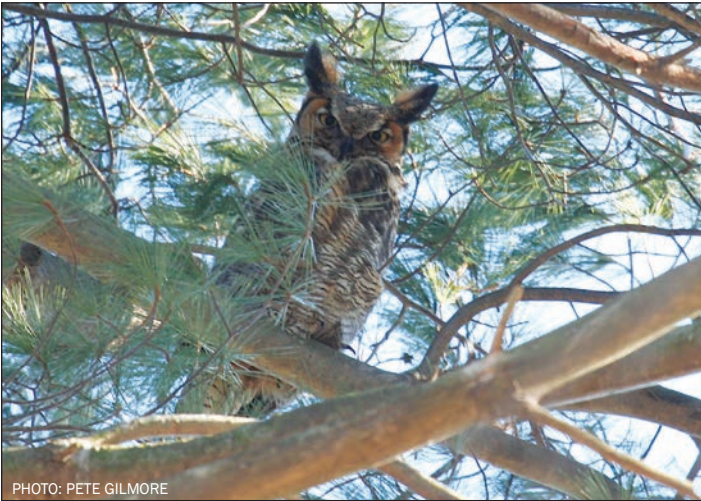
Great Horned Owl near Flowed Meadow

There are a number of bird species around the world in which both male and female sing, and often sing duets with each other. You might think that this happens in exotic places with exotic species, and it does. What is surprising to many Newton residents is the fact that four of our common, local species sing male-female duets. These are our Northern Cardinals, Carolina Wrens, Great Horned Owls and Barred Owls.