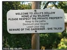
Jolly's Hollow Sign

For years I have cherished the ability to walk off-road along Newton's aqueduct trail from the Four Corners area to Mason-Rice Elementary School. The highlight of that trip, as many lucky aqueduct walkers know, is the winding path through Jolly's Hollow, a secluded dell with a little stone bridge to one side and shaded by gloriously tall healthy trees. Though the path actually runs through private property, for the past many years a charming pair of signs have invited us in: "Welcome to Jolly's Hollow. Please keep to the paths, Beware of the gardener, she talks!" I always wanted to thank that chatty gardener, and would sometimes glimpse her among her gorgeous flower garden and ornamental trees, but I was too shy to tell her how much it meant to me to walk through her beautiful grounds.